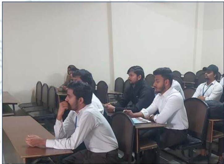
Students attending the seminar