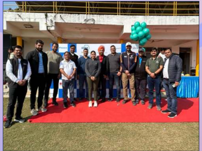
IIMT Team during Cricket Tournament